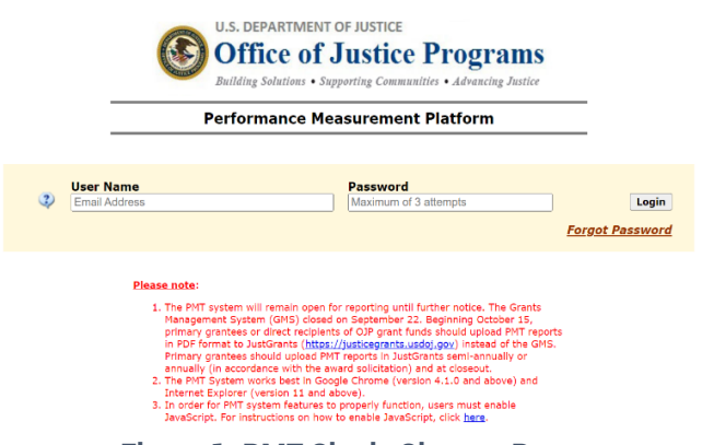
Figure 1. PMT Single Sign-on Page

When logging into the PMT for the first time, the system will direct you to the Profile page. While on the profile page, you should check your profile for accuracy. If the information in your profile is incorrect, confirm it in JustGrants, as the data in the PMT is pulled from JustGrants. If the information in JustGrants is correct and it needs to be updated in the PMT, contact the PMT Helpdesk and your Grant Manager. If the information in JustGrants is incorrect, you will need to submit a grant adjustment modification (GAM). If you need assistance with submitting a GAM, reference the Grant Award Modification Job Aid Reference Guide or contact your Grant Manager.