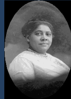
Ida B. Wells Mary Talbert, and Frederick Douglass advocated for enactment of federal laws to criminalize racial crimes