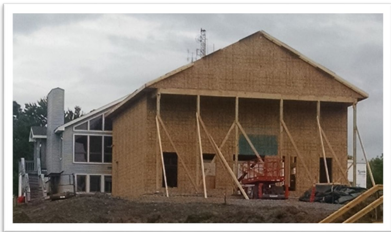
Courthouse Renovation and Expansion to Existing House (Before)